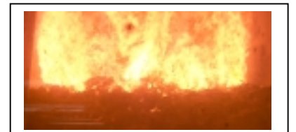
Pictures above: Thermal images of the whole surface of the great (fuel bed). Location of the area with the maximum heat release (main combustion zone). Image with the border line of the burning area and the burned mass with final cooling zone