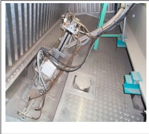
Picture above: IR-camera system with moving device Picture on right side: process cabinet for the security extraction device.